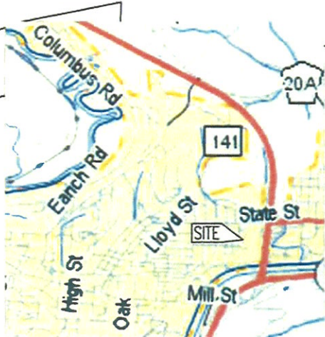
VICINITY MAP 1"=4000'

Description Checked for Mathematical Accuracy Athens County ENGINEER'S OFFICE