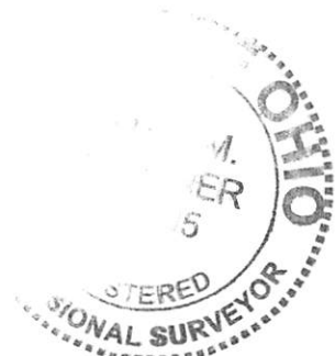
Map Showing Survey of 4.20 acres an Existing Tract of Record (499-156 O.R.) in Section 11, T. 11, R. 14 Trimble Twp. Athens County, Ohio