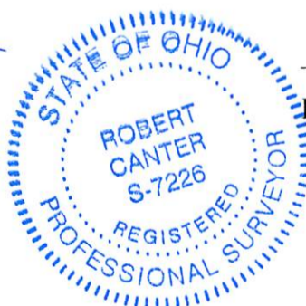
Robert C. Canter, P.S. 7226

Bearings are NAD 83(CORS), Ohio State Plane, South Zone Grid. Based on GPS observations. Reference the east line of Section 35 as being South 04 degrees 00 minutes 36 seconds East.