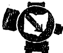
EXHIBIT A - PARCEL 2