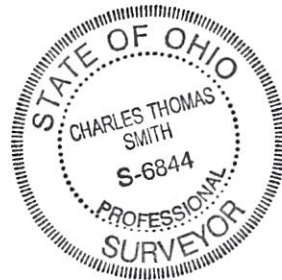
Ohio Professional Surveyor No. 6844